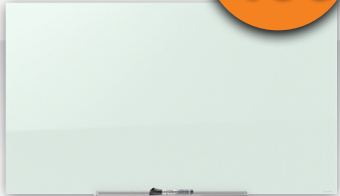
InvisaMount™ Magnetic Glass Board